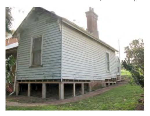
Above - After the re-stumping had finished. Right - The new bearers in the non - existing Passageway