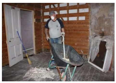
Right - After the walls had been uncovered, "What a historical find", A Heritage Architects dream.

Right - When the plumbers had just about completed their job.