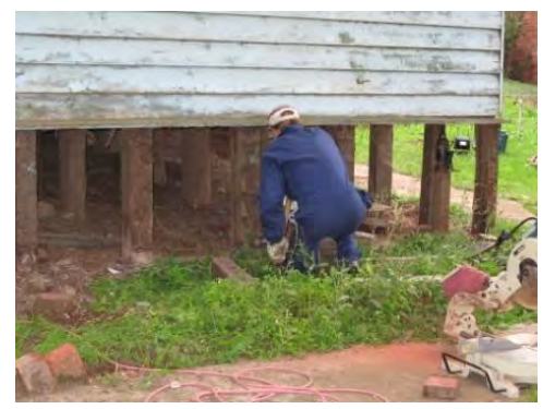
Above - One of Will Cass's employees,Right - Will Cass lifting the floor boards in the soon to be archival room (back room)

On the 27th April 2010, we have finally seen the commencement of works on the old wooden section of the Shire Offices. This day seen the re-stumpers start their job of restumping the two rooms plus the old toilet/bathroom (LL) out the back.