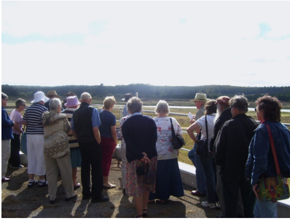
Our Bus Trippers At The Moorabool Reservoir

The place is available for hire and enquiries can be made to 5334-0292. Of course, the jewel in the crown, the reservoir, has held much larger amounts of water than at present but still made a big impression on us all. Many thanks to the Friends of Moorabool for their time and hospitality.