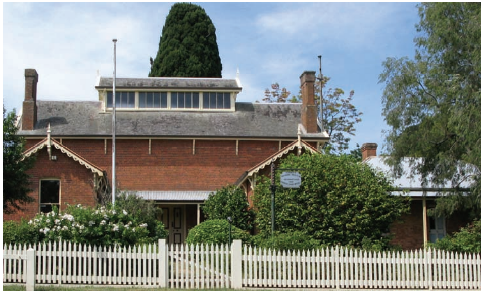
High Street. Learmonth

FOUNDED 1983. INCORPORATED 13/10/1986. INCORPORATION No. A 11213. ABN No. 22 133 588 072.